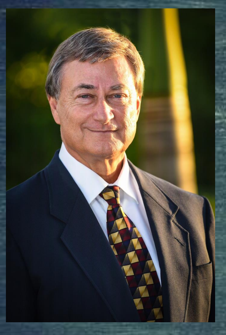
My profile on LinkedIn https://www.linkedin.com/in/stevekodad/